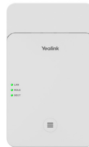
Yealink DECT W75B