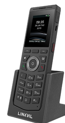
Fanvil Linkvil W610W