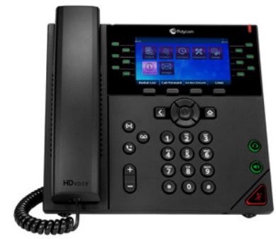
VVX450 OBi Documentation