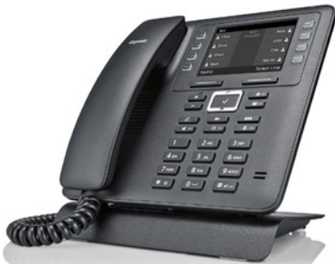
Maxwell 2 Documentation