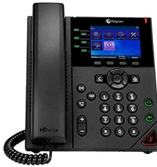
VVX350 OBi Documentation