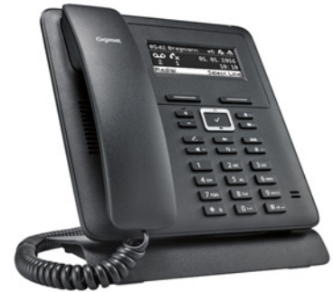
Maxwell Basic Documentation