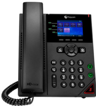
VVX250 OBi Documentation