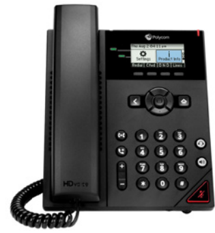
VVX150 OBi Documentation