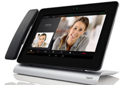
Maxwell 10 Documentation