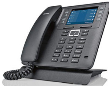
Maxwell 3 Documentation