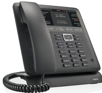
Maxwell 4 Documentation