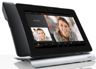
Maxwell 10S Documentation